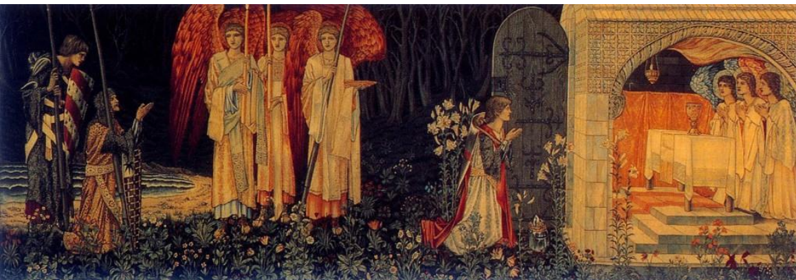
The Achievement of the Graal