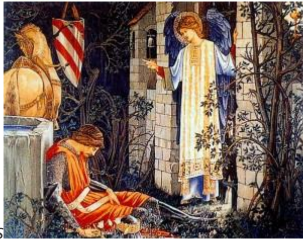
The Summons Launcelot