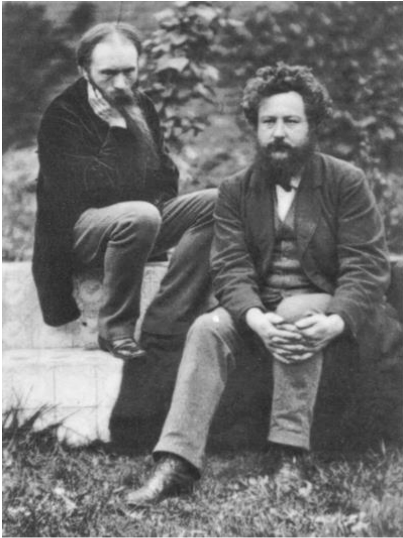
Burne-Jones and Morris