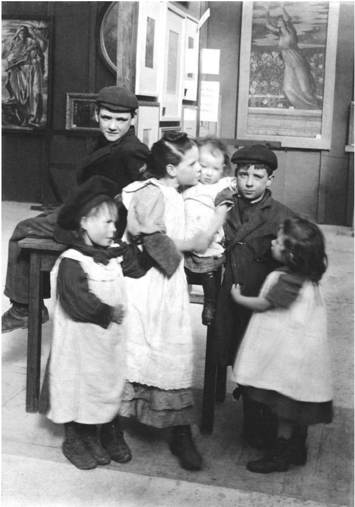
Sir Edward Burne-Jones "If hope were not, hearts should break"