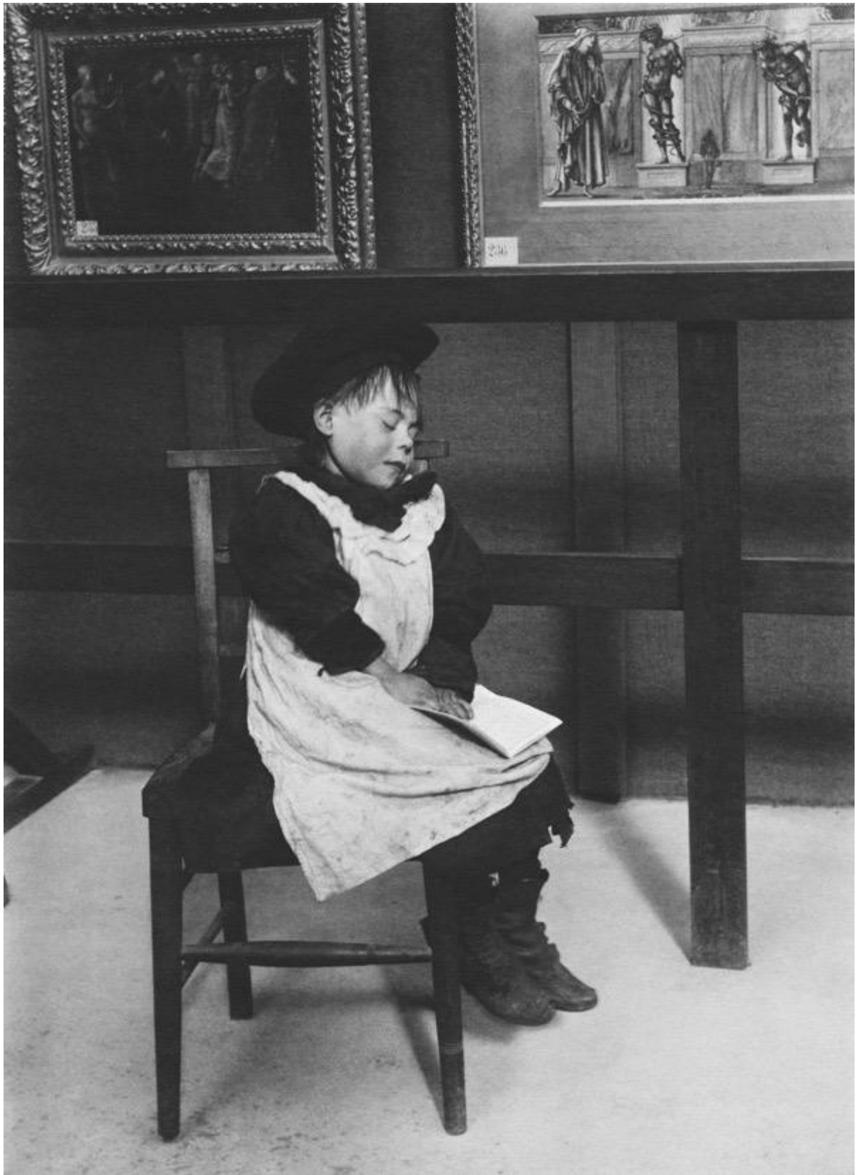
Tired of Art – A little Dorset St sleeper in Whitechapel Picture Gallery