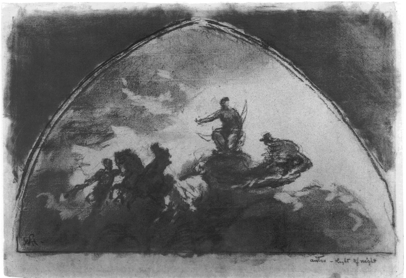
Figure 5 WILLIAM MORRIS HUNT.

Anahita: The Flight of Night. Study for Mural in the Assembly Chamber, New York State Capitol, Albany.