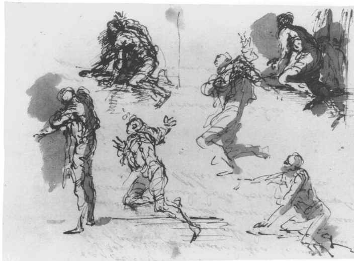
Figure 2 SALVATOR ROSA. Six Studies of Figures for "The Angel Raphael Leaving the House of Tobit."

The Art Museum, Princeton University, Bequest of Dan Fellows Platt.