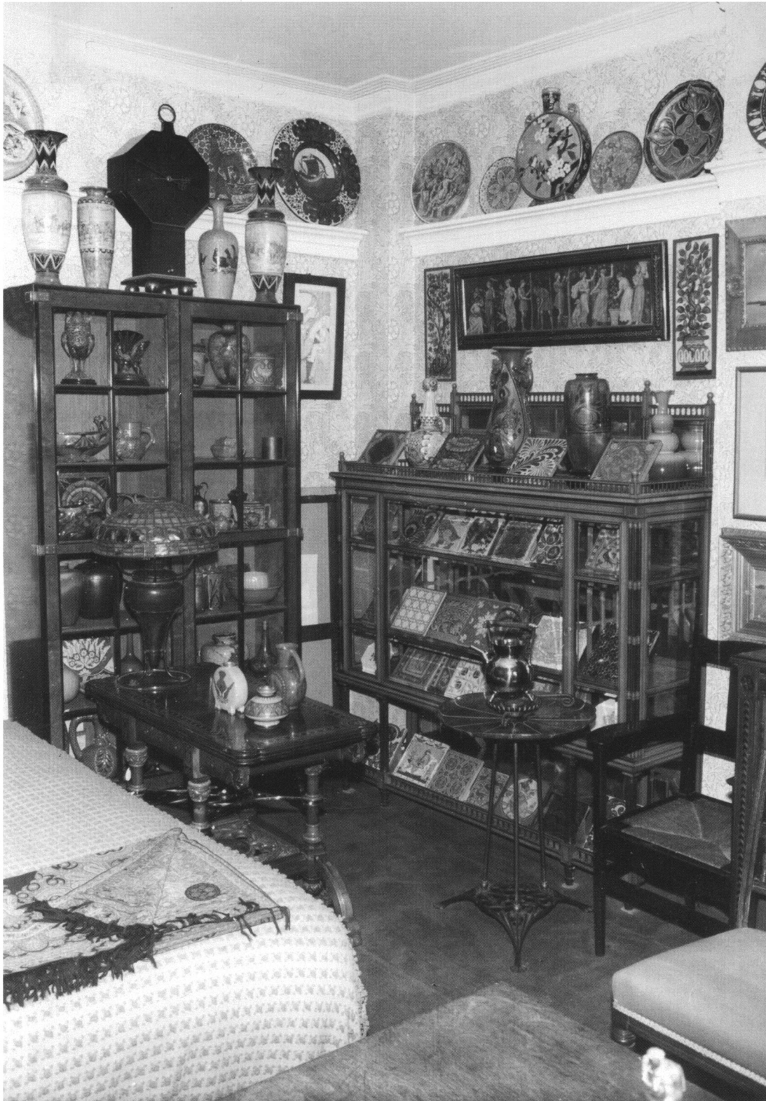
Charles Handley-Read's bedroom at 82 Ladbrooke Road; photography courtesy of the Higgins Museum, Bedford.