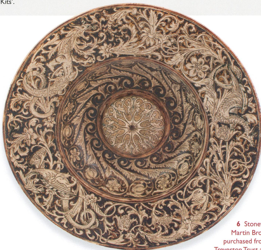
6 Stoneware Charger made by the Martin Bros, Southall, 1889; Diam. 33.7 cm; purchased from the Fine Art Society, Treverton Trust acc. no. 34.