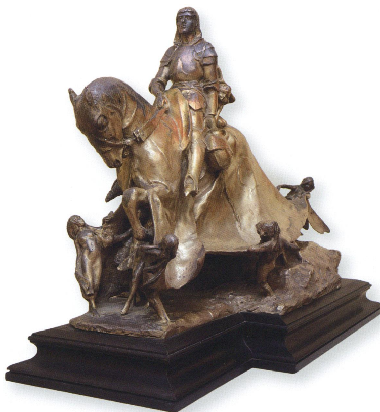
4 Knight Errant by Gilbert Bayes, 1898; electrotype on ebonised wood base; L. 64 cms; the plaster model first shown at the Royal Academy in 1898; purchased from the Fine Art Society, Treverton Trust acc. No. 49

10 Pictures [ here there are some remarks about acquiring pictures in the future ]'...if we heard of pictures at a bargain price' but that there might be a 'better chance of prints.'