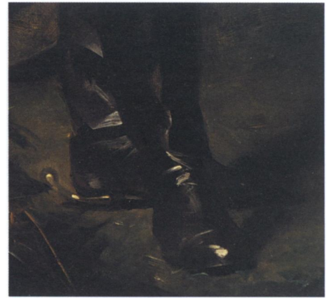
50. Detail of Fig.47.

this point, in the form of a diagonal black line immediately to the right of the little reserve of unpainted ground (Danloux does not allow such reserves) at the junction of the hat and coat, from which breaks at virtually a right angle a much broader sweep of lean whitish grey. Two crossed strokes of the same mixture immediately above this create a tiny explosion of paint. The area as a whole is free and open, although on a small scale, in a way that typifies Raeburn's distinctive style.