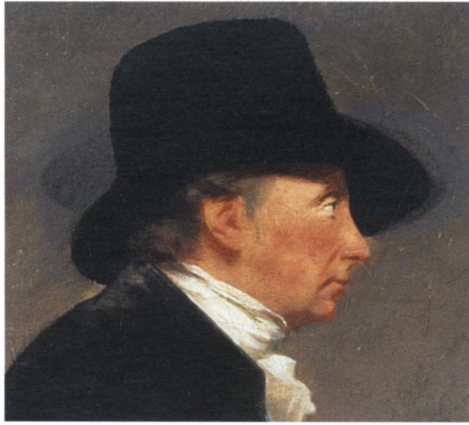
48. Detail of Fig.40.