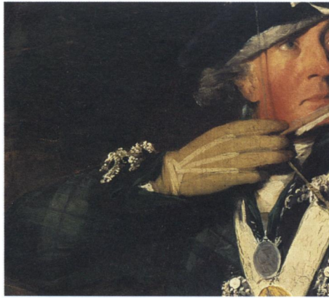
49. Detail of Fig.44.