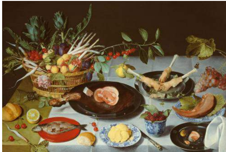
A Still Life of a laid Table, with Plates of Meat and Fish and a Basket of Fruit and Vegetables by Jacob Van Hulsdonck