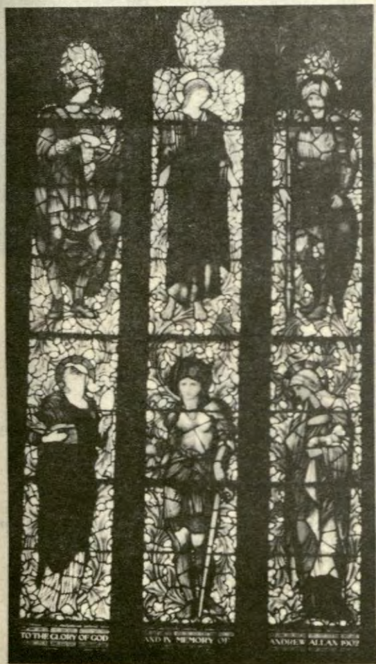
R, below: "JUSTICE, HUMILITY" (1883) by Burne-Jones, at Church of Our Savior, Brookline, Mass.