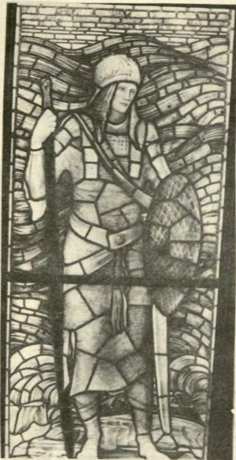
"LEIF THE LUCKY" (1884) by Burne-Jones, at Kentland Farms, Rockville, Maryland.