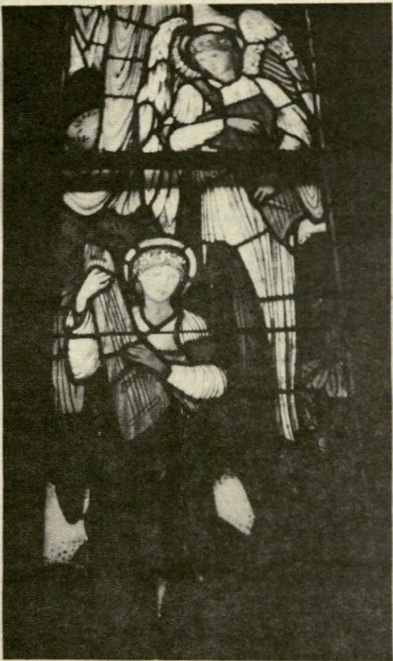
L, above: "ANGELS OF PARADISE" (1885) by Burne-Jones, at the Church of the Incarnation, New York.