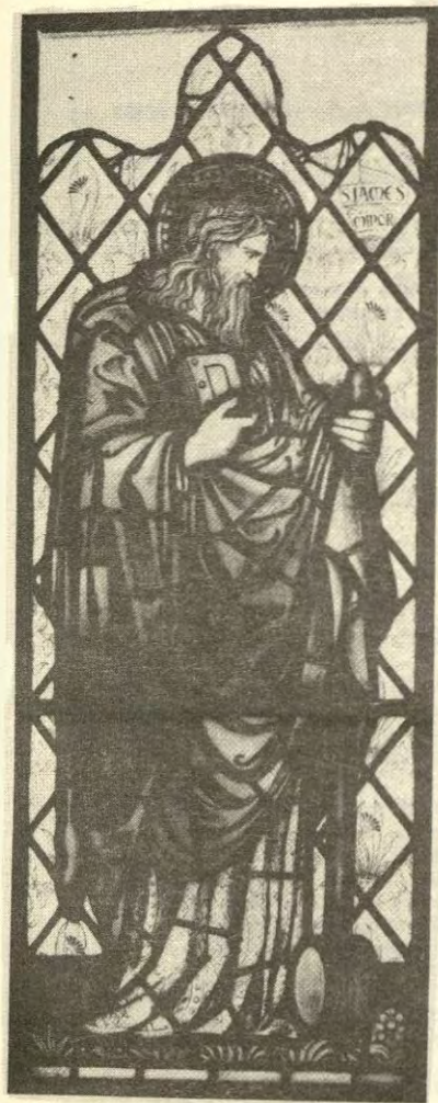
Illustration by St. Francis Monastery founded by St. Francis