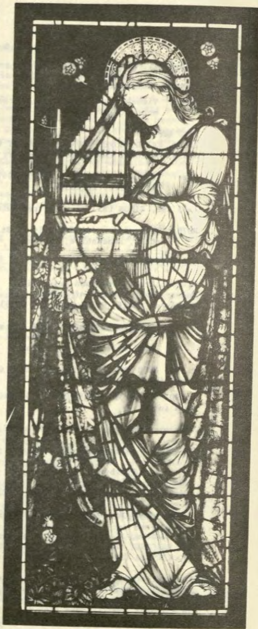
"ST. CECILIA" (c.1880-85) by Edward Burne-Jones, at the Princeton Art Museum in Princeton, New Jersey. Photograph courtesy of the Art Museum. Princeton University Surdna Fund.