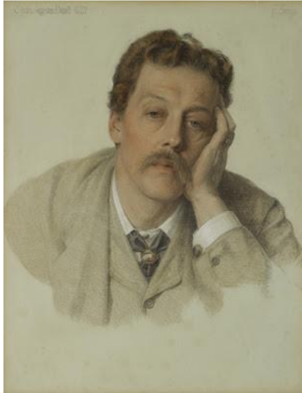
Charles Augustus Howell (1882) Frederick Sandys