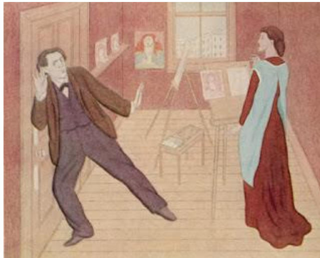
Mr. ___ and Miss ___ nervously perpetuating the touch of a vanished hand (1922) Max Beerbohm