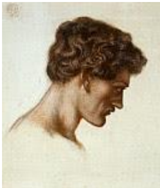
Study for Dante's Dream D G Rossetti

I think it is probably no coincidence that Rossetti welcomed Howell into his life after Lizzie's death when possibly his judgement may have been a little wobbly. Howell was able, charming and persuasive, and if you needed something Howell was your man. Need some more blue and white china? Howell would oblige. Need some paintings selling? Howell was your man. Need your dead wife exhuming? Charlie's your boy. Pre-Raph's Mr Fix-it was the one who secured the return of the little book of poems, inconveniently left in the embrace of Lizzie. What a man!